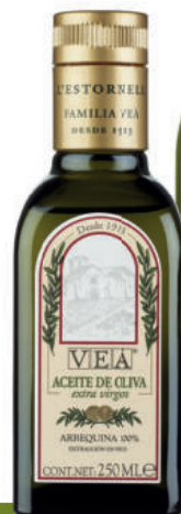
VEÀ EXTRA VIRGIN OLIVE OIL