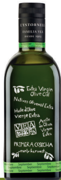
VEÀ EARLY HARVEST